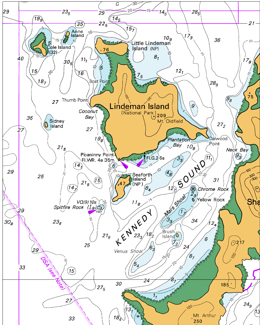
Block B for chart Aus 252

To accompany Australian Notice to Mariners 242/2025